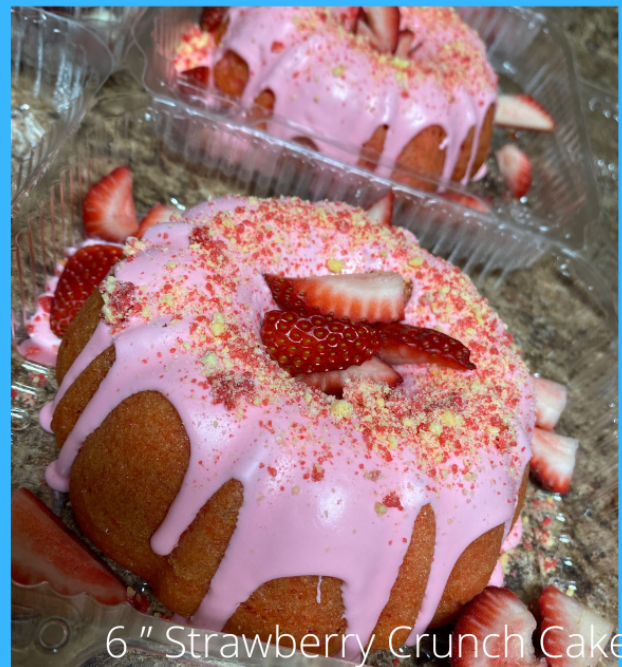
6" Strawberry Crunch Cake

Delivery fees may be applied, Please order 3 days ahead. Payment due in full when booking.